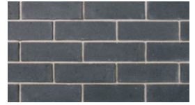
ONYX Sizes: Multi Bundle†, PRP†