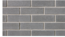
SHADOW Sizes: Multi Bundle†, PRP†