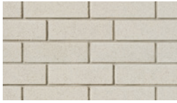
POLAR WHITE Sizes: Multi Bundle, PRP†

† = Stock Item Product. Manufactured in our Hillsdale, Ontario plant. Colors may vary due to the manufacturing process.