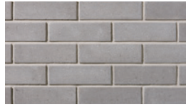
NICKEL Sizes: Multi Bundle†, PRP†