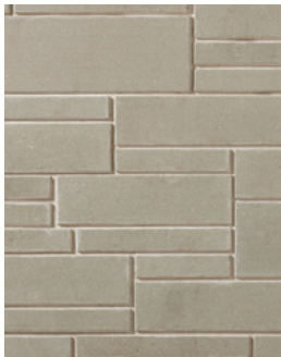
OLIVE Sizes: Multi Bundle†