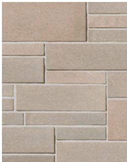
SANDBAR Sizes: Multi Bundle†