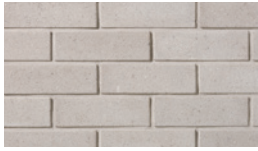
DOVER Sizes: Multi Bundle†, PRP†