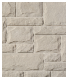
DOVER Sizes: Combo & Large Combo