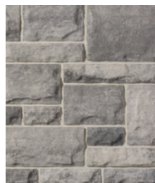
MARBLE GRAY Sizes: Combo & Large Combo