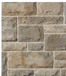
CHAMPAGNE Sizes: Combo & Large Combo