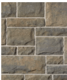
HARBOUR MIST Sizes: Combo & Large Combo