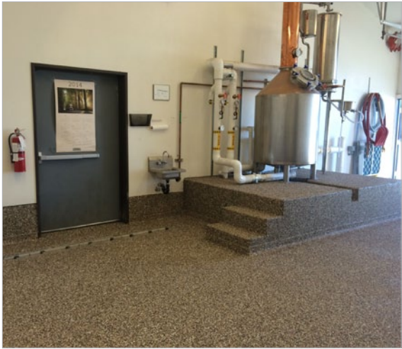
CSI Division 9: Finishes - Flooring